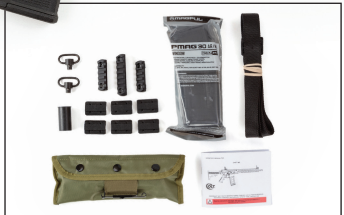
Example of Accessory Kit