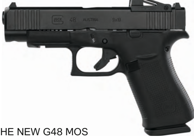
THE NEW G48 MOS