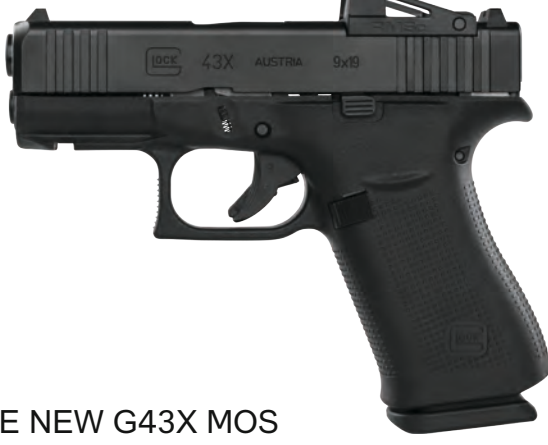
THE NEW G43X MOS

The G48 MOS in caliber 9 mm Luger is of similar length and height as the G19 but the width of the pistol is reduced for increased concealability and better carrying comfort.